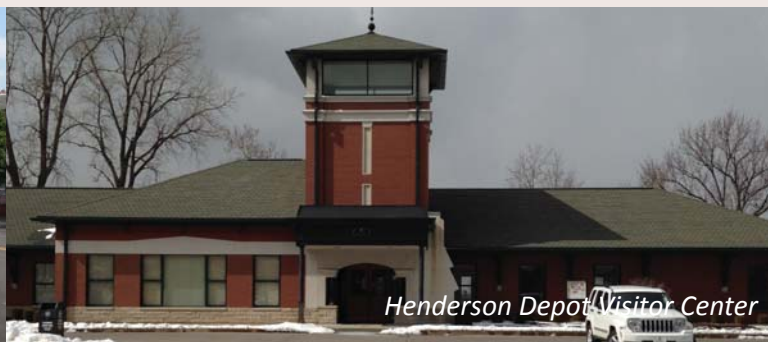
Henderson Depot Visitor Center