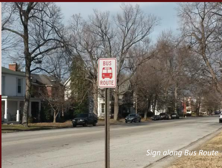
Sign along Bus Route

Your driver is an experienced professional who has thousands of miles of driving experience and a special understanding of the entire HART system. If you have any questions regarding routes or procedures, just ask your friendly HART driver.