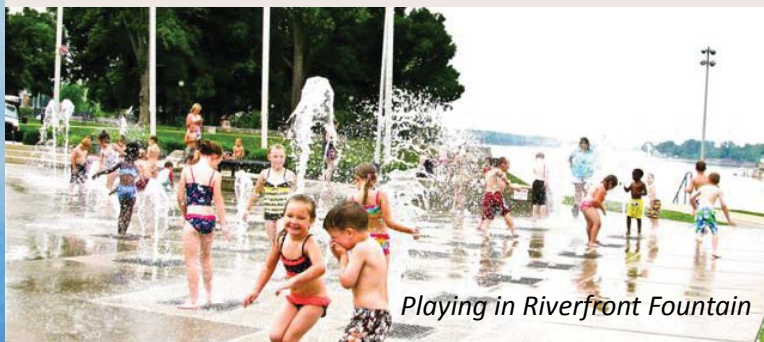
Playing in Riverfront Fountain

All students attending school in the HART service area, ages 6 to 18, may purchase student fare tickets for 25 cents.