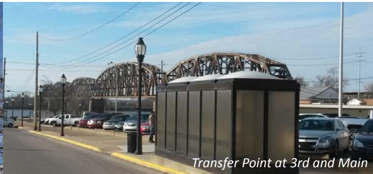
Transfer Point at 3rd and Main