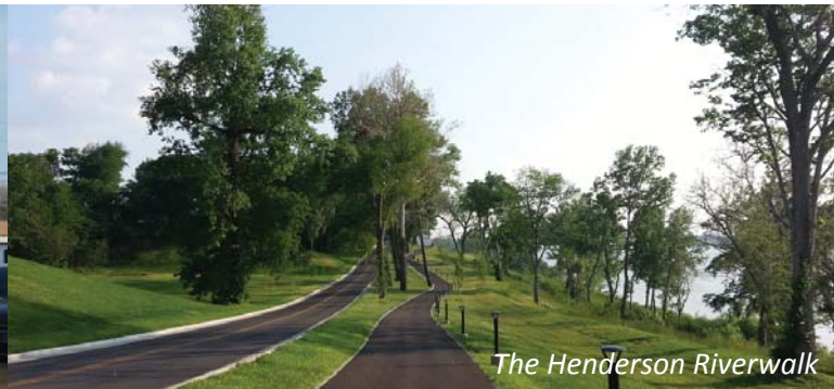
The Henderson Riverwalk