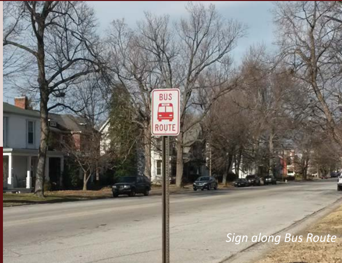
Sign along Bus Route