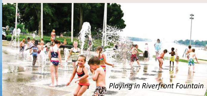
Playing in Riverfront Fountain