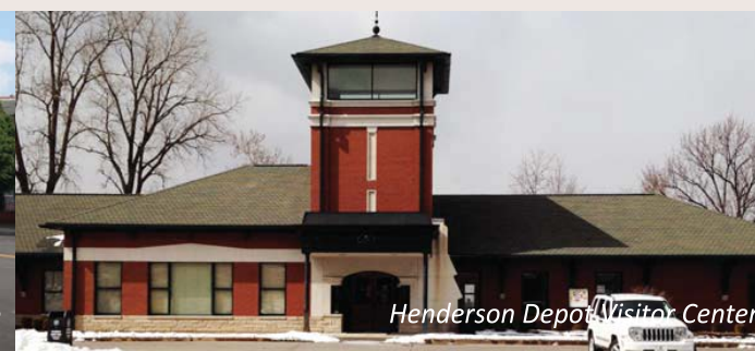
Henderson Depot/Visitor Center