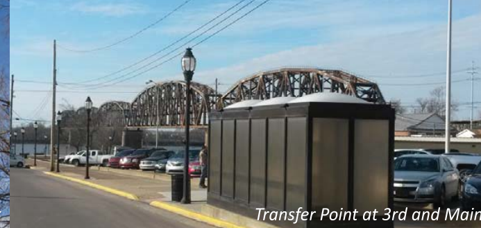
Transfer Point at 3rd and Main