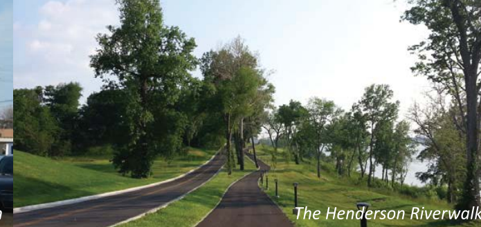
The Henderson Riverwalk